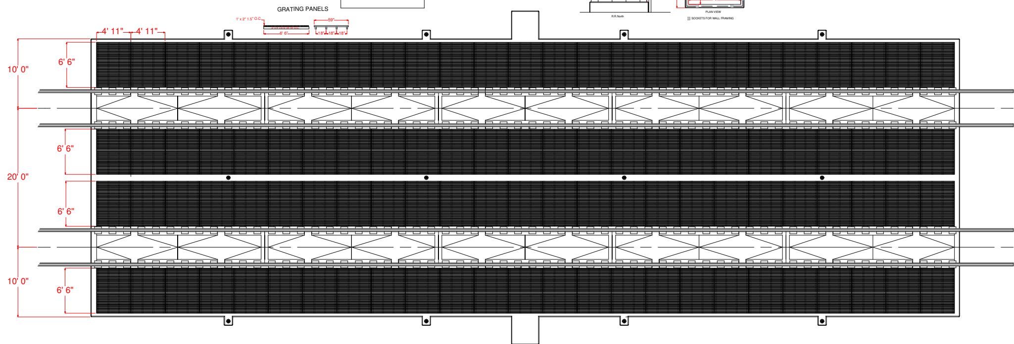
WASH RACK PLAN VIEW WITH GRIDS INSTALLED