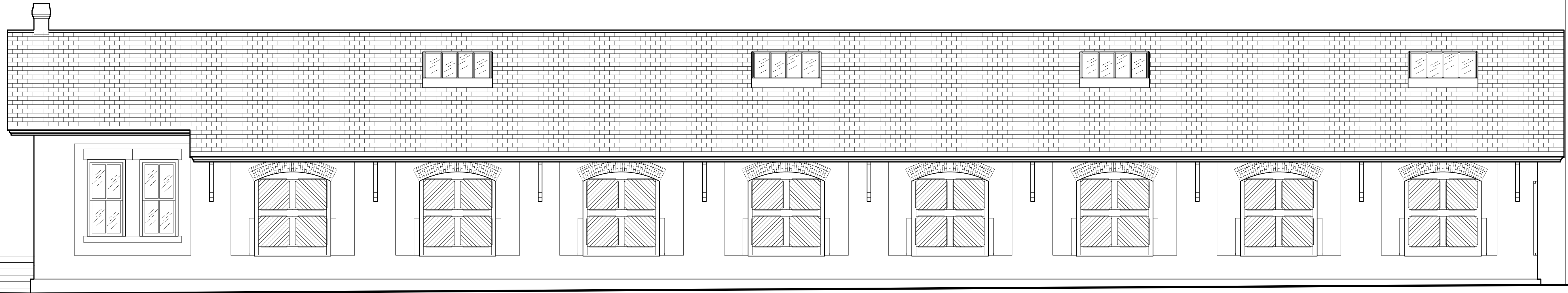
1 SOUTH ELEVATION SCALE: 3/16" = 1'-0"