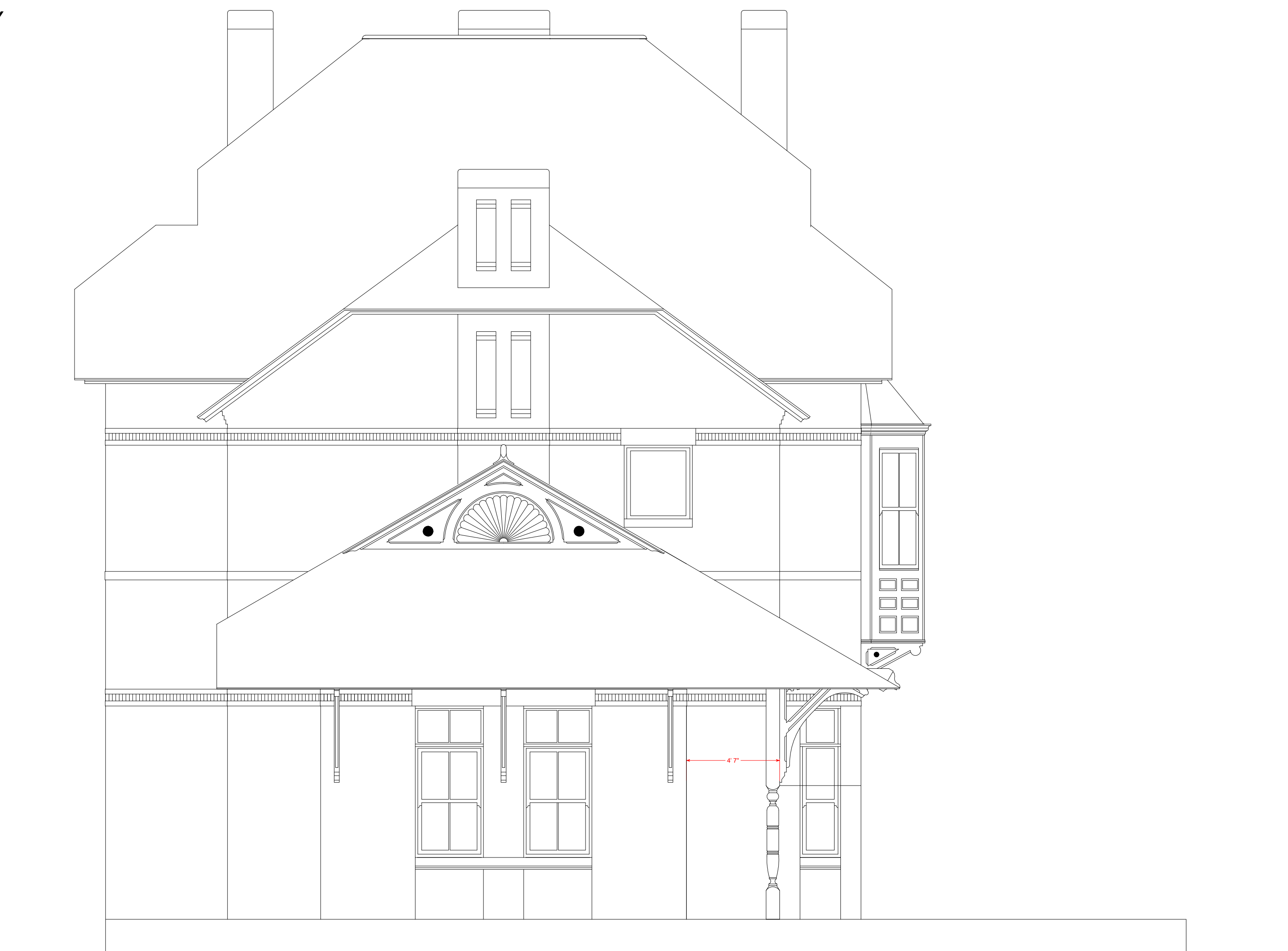
RAILROAD WEST ELEVATION