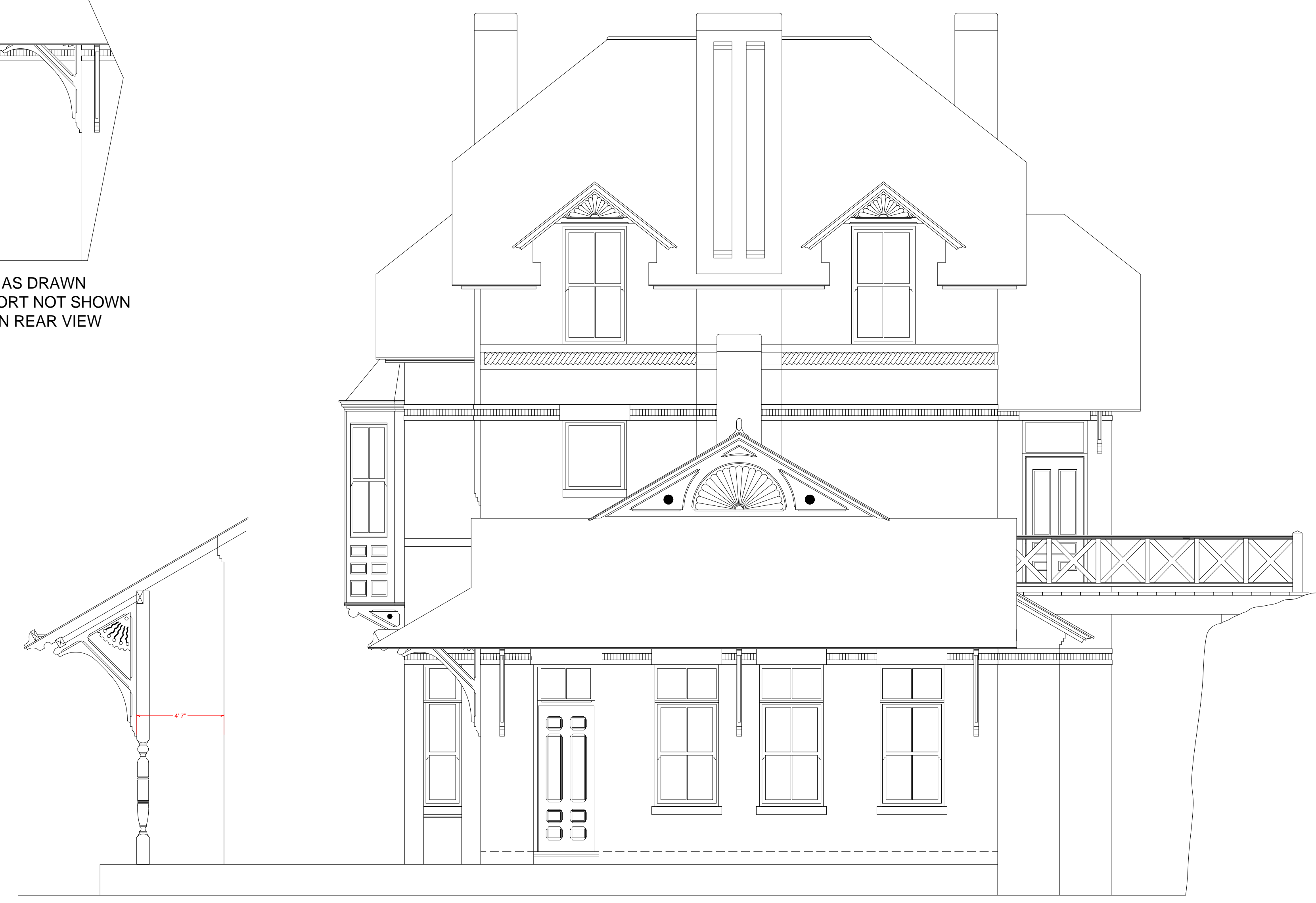
RAILROAD EAST ELEVATION