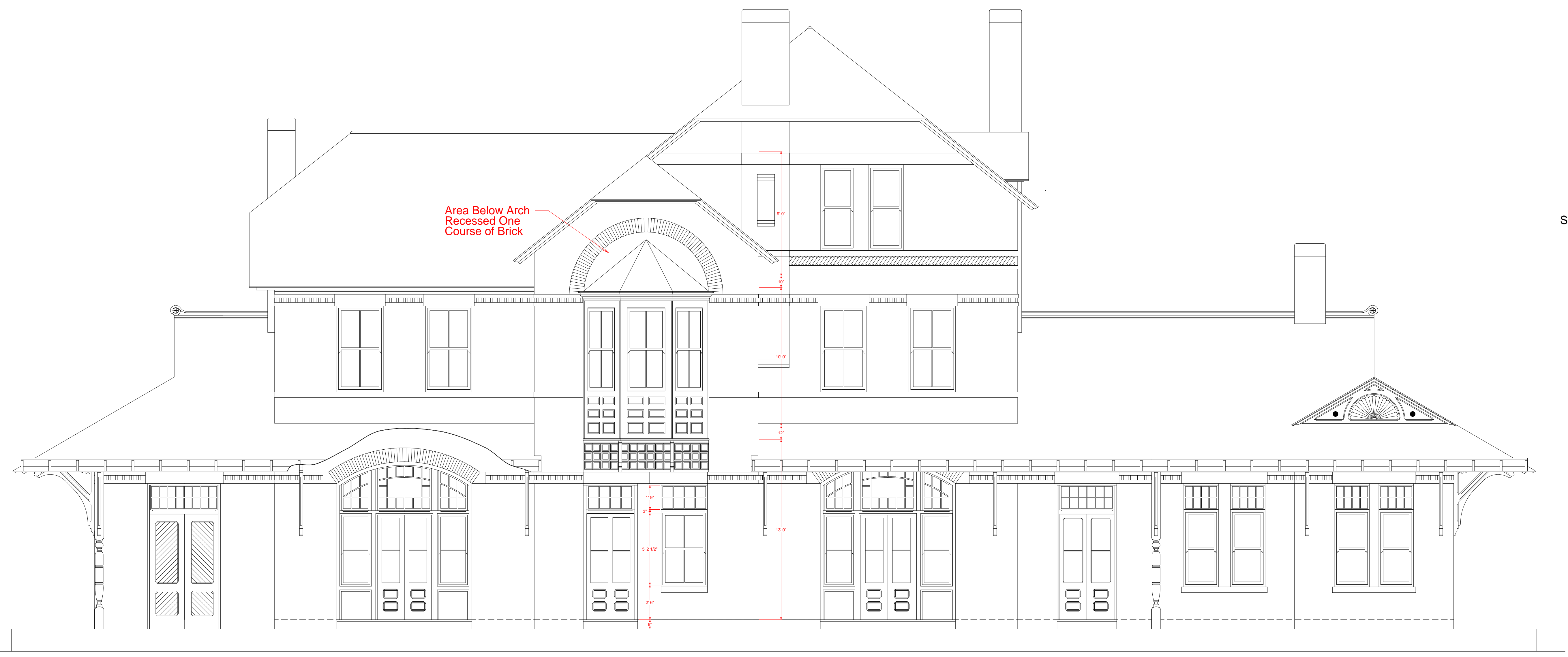
RAILROAD SOUTH ELEVATION