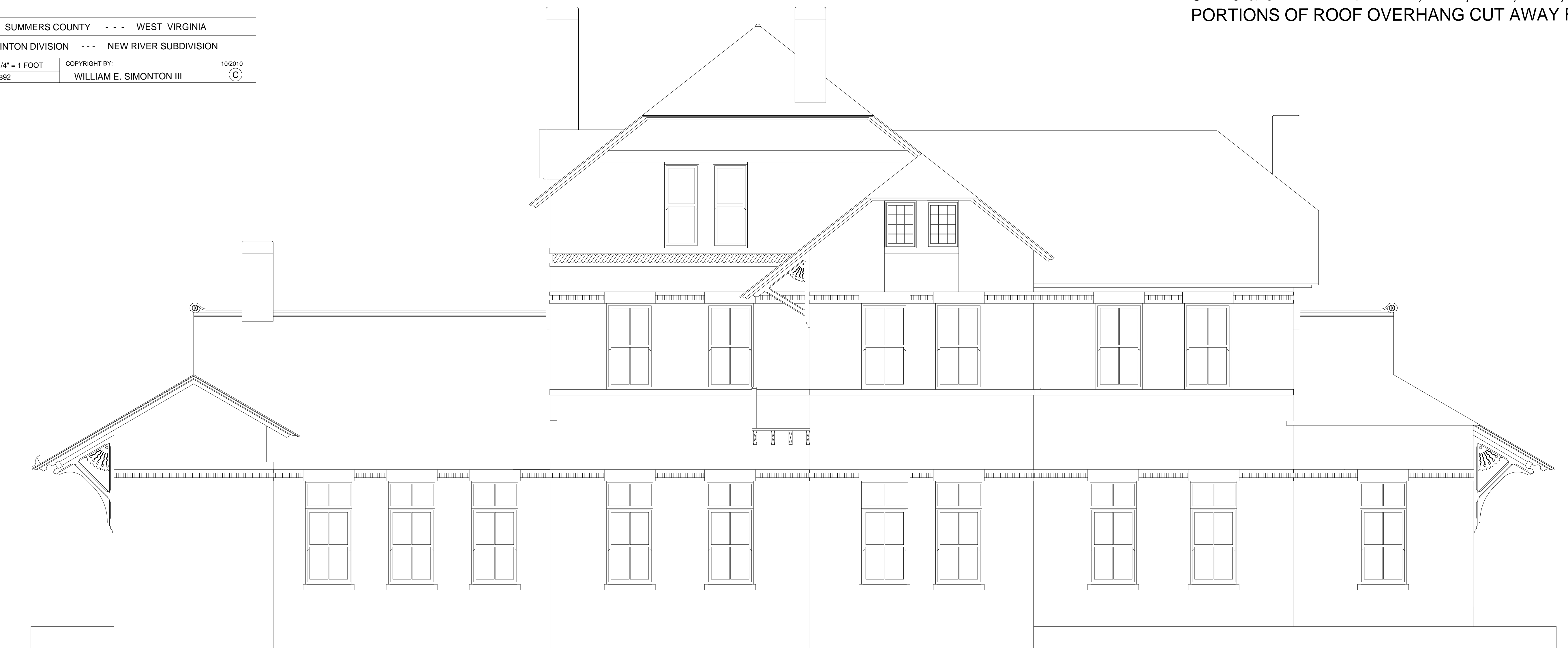
RAILROAD NORTH ELEVATION

SEE C & O DRAWINGS 1015, 1016, 1017, 1018, 1019 (1891) PORTIONS OF ROOF OVERHANG CUT AWAY FOR CLARITY